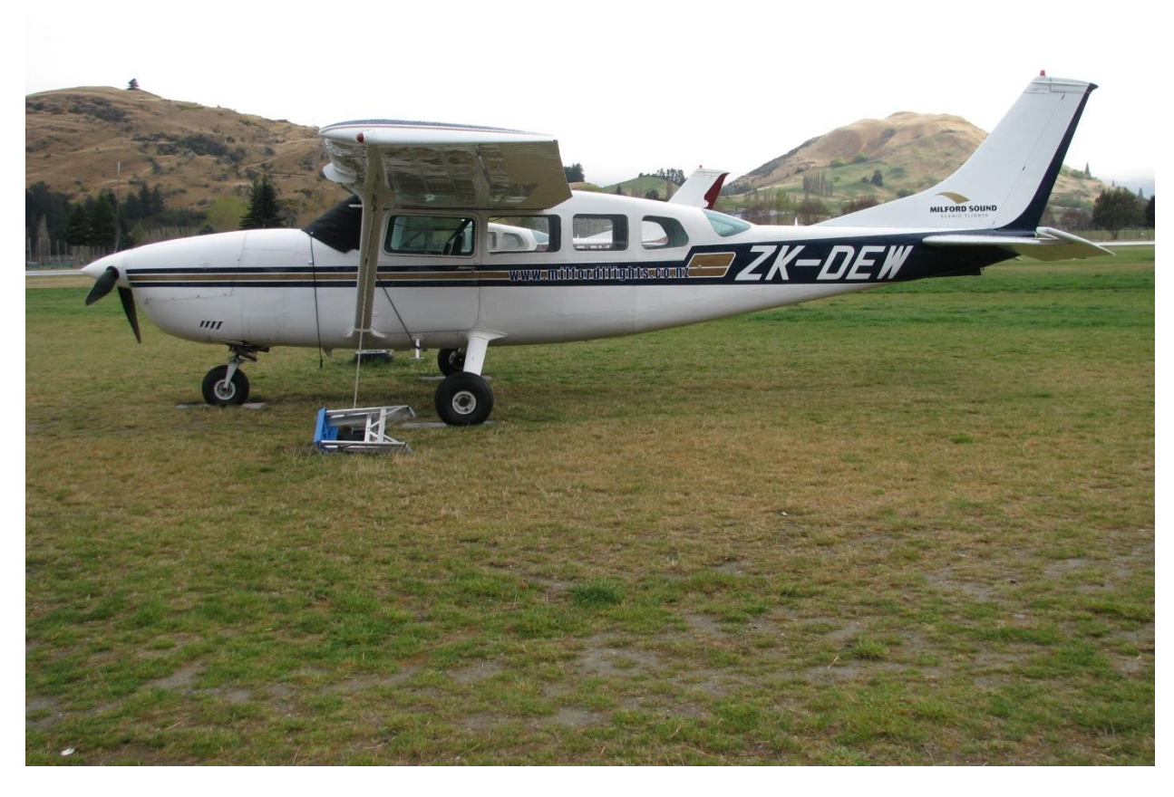
Cessna 207, ZK-DEW