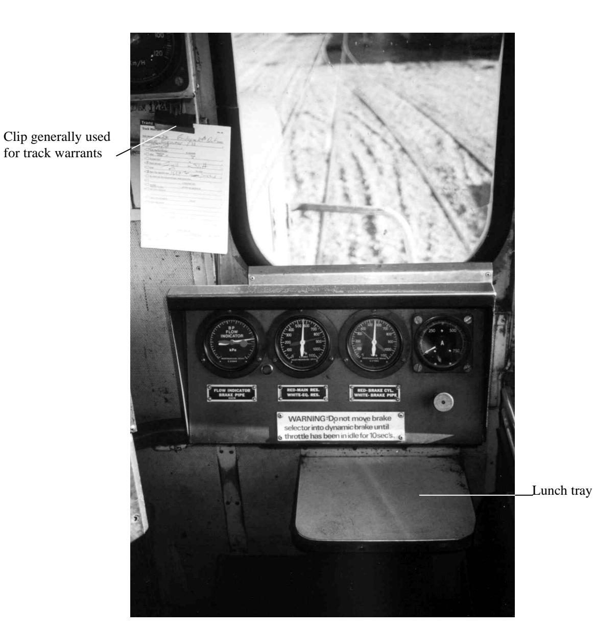
Figure 2 The position of the track warrant clip in a DBR class locomotive cab (similar profile and configuration to a DC class locomotive cab)