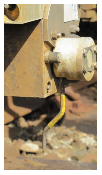
Figure 3 A signal trip installed at Signal 39 (left) and the trip lever on a Matangi train (right)

3.2.4. Signal 38 was not equipped with a signal trip device, so in the event of an overrun there was no automatic means of stopping a train before it reached the crossover points. The Commission has recommended that such a device be installed.