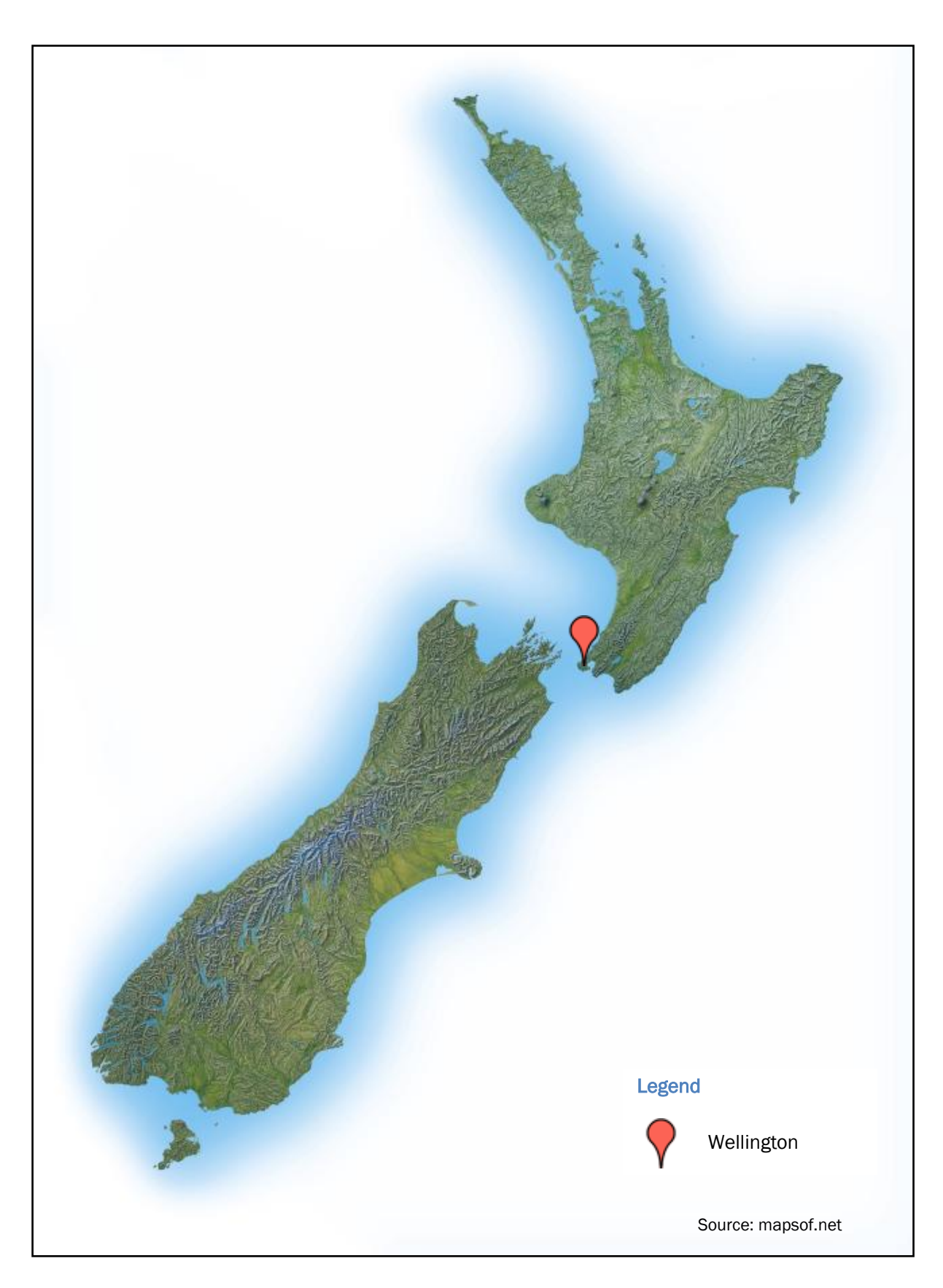
Location of accident