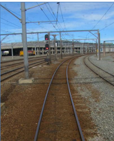
Figure 1 Signal 145 at yellow (left) and Signal 38 at red (right)