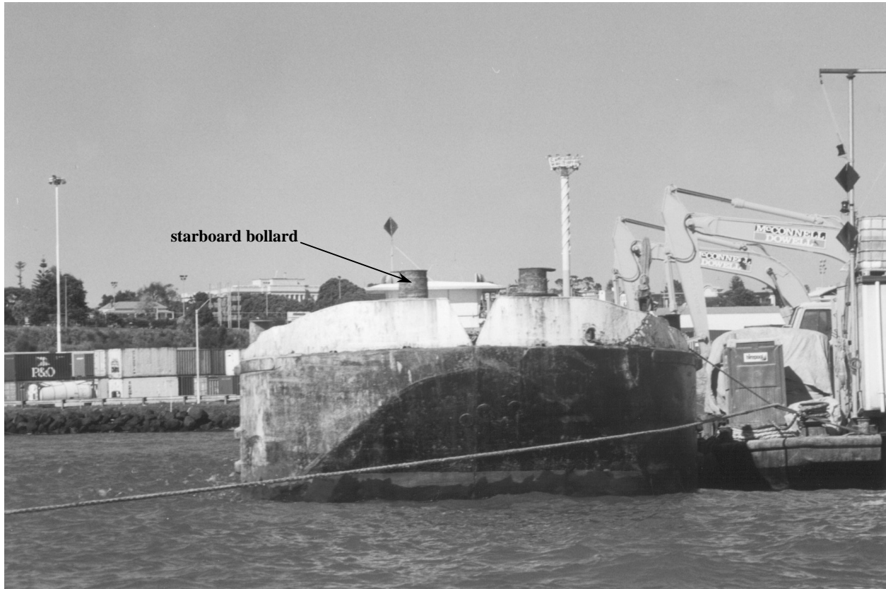
Figure 2 Empty hopper barge H7 alongside the mixing barge