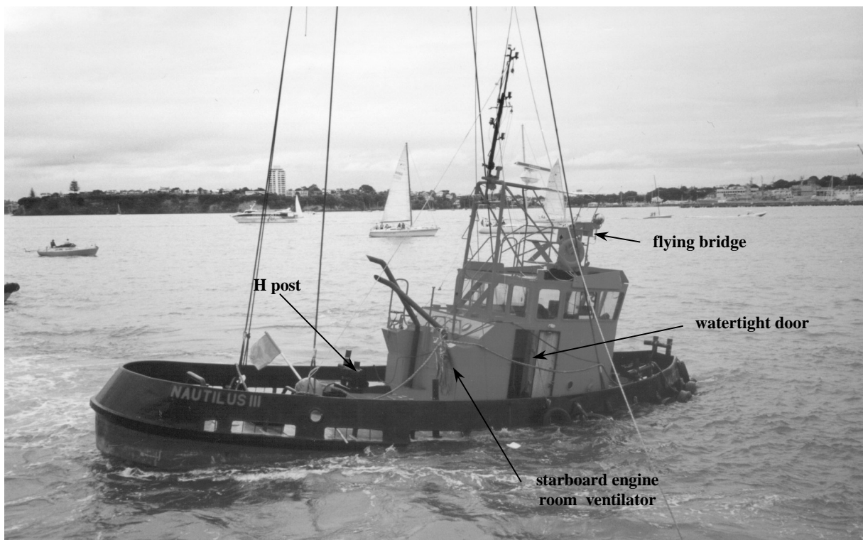
Figure 3 The Nautilus III during salvage; note open watertight door