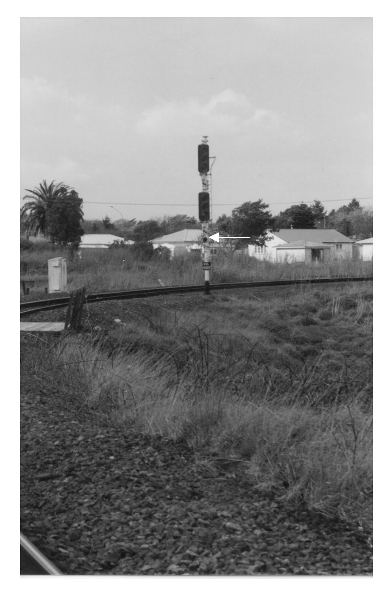
Figure 2 Signal 4R from about 200 m away. The low speed light unit is arrowed.